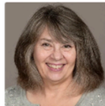
Cris Kennedy Building & Grounds